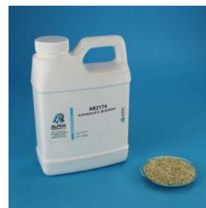
AR2174 (90210) Sodium Hydroxide