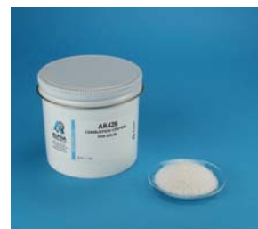
AR426 (88400-008) Combustion Control (solids)