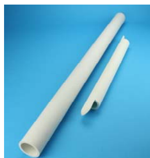
AR90162 Ceramic Combustion Tube AR36101 Boat Stop