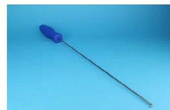
ELTRA Boat Removal Stick AR36217