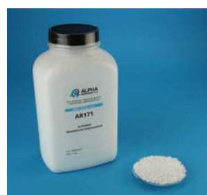
AR171 (90200) Magnesium Perchlorate