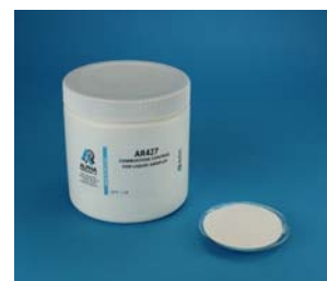
AR427 (88400-008) Combustion Control (liquids)