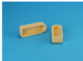
Ceramic Combustion Boats AR8203 (90153) (500/box) 57mm x 22mm x 14mm **other pack sizes also available**