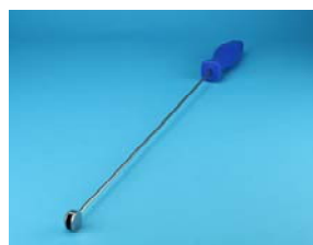
ELTRA Boat Insertion Stick AR36216

This is a small sample of the complete line of organic standards Alpha offers. For a complete list visit our website: www.alpharesources.com