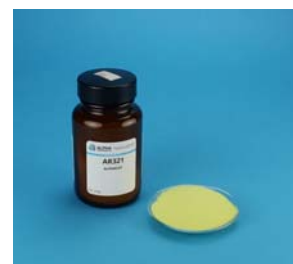
AR321 AlphaCat Combustion Aid