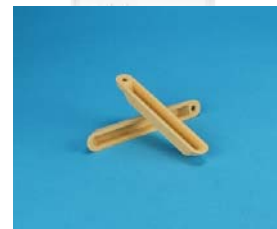
Ceramic Combustion Boats AR8053(90160) (500/box) 92mm x 12.7mm x 10.5mm **other pack sizes also available**