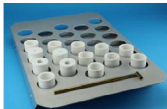
Alpha Crucible Holder Tray AR1265