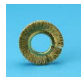
Auto Cleaner Combustion Tube Brush AR14045 (14045)