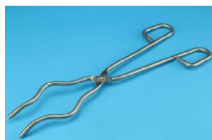
AR929 (90145) Crucible Tongs