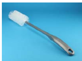
AR71030 (71030/71036) Filter Brush