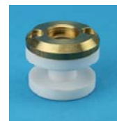
Heat Shield AR14072 (14072)