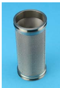
Dust Filter AR311 (11105)