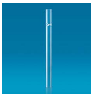
Quartz Tube for Oxidation Furnace AR104001 (JW-Z010104001)