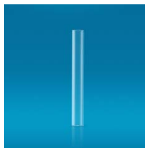
Quartz Tube AR430808 (JW-K430808A00)