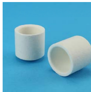
Ceramic Crucibles Foil Wrapped or Bagged AR3818F or AR3818 NEW High Purity Crucibles AR3818HP Foil Wrapped Box of 500