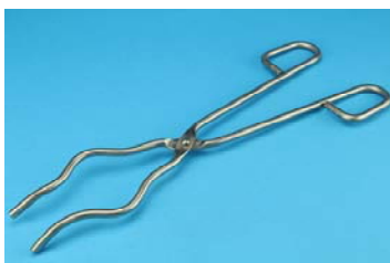
Crucible Tongs AR929