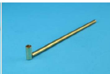
Tungsten Scoop AR579