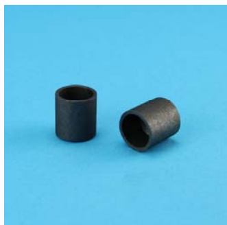
AR8762 Graphite Crucible (S30922700)