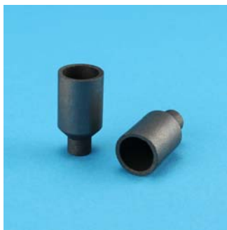
AR782HD Graphite Crucible