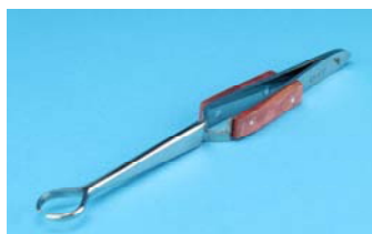
Crucible Tweezers AR766