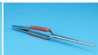
Sample Tweezers AR138

Alpha Canada Inc Exclusive Canadian distributor of Alpha Resources MI, USA