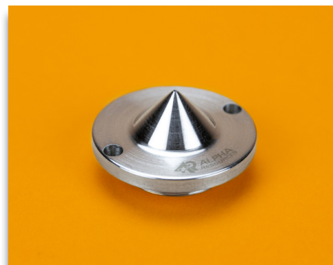
Skimmer Cone (AR95001)

Since its founding, Alpha Resources has continued to expand its product line and quality programs resulting in a broader range of high quality products for you and your customers. With our ever-growing product line, we can provide you with all of your routine consumable and certified reference material needs. Our quality accreditations (ISO17034, ISO17025, ISO9001:2015) give you the needed assurances that our products will perform in your customers' applications with consistency and predictability.